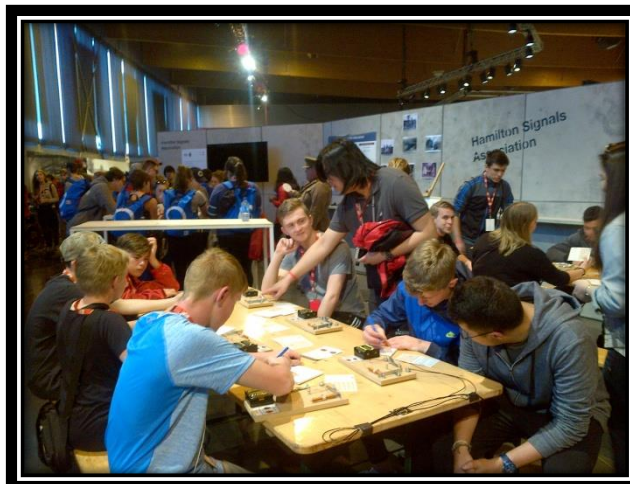
A teacher helps Students send messages on the keys they have just made at the Signals Workshop in EF’s interactive educational centre during the Vimy 100 commemoration in Arras