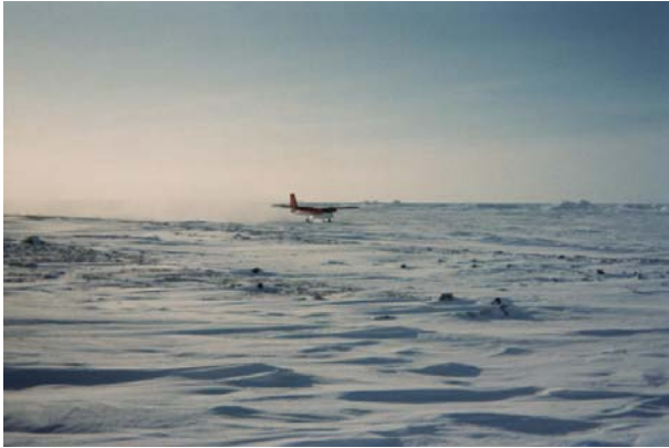
Plane arrives with soldiers and kit for the AOA course