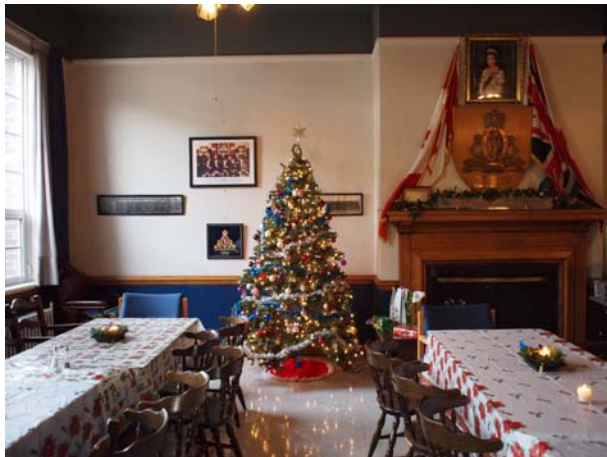
WO's & Sgt's Mess Decorated for the occasion