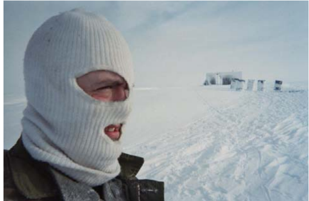
Soldiers from 709 and 700 combined forces to form