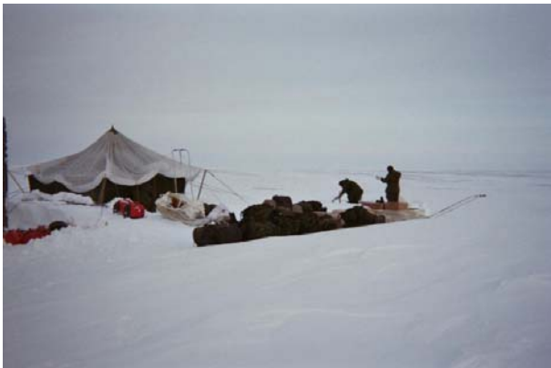
Camp being setup with the limited amenities available. If you didn't bring it, your not going to get have it!