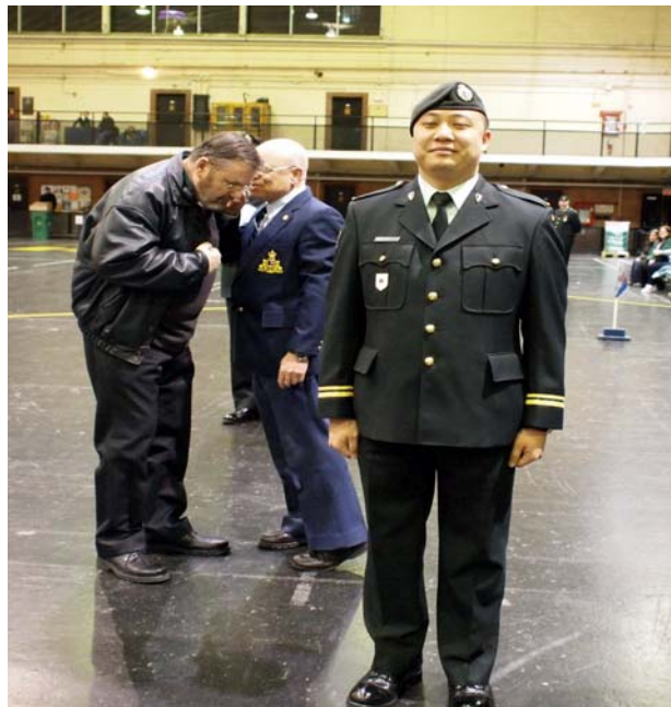
I wouldn't trust my career to these guys!