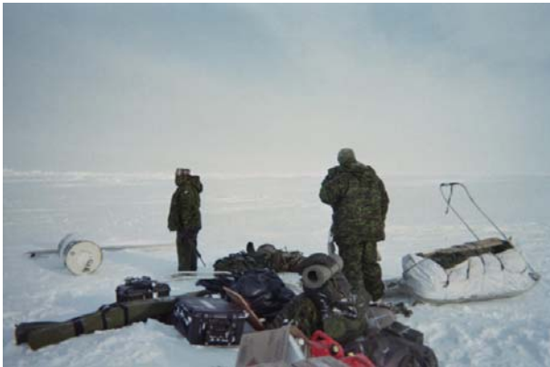
Signallers and kit dropped off for 20 day course duration.