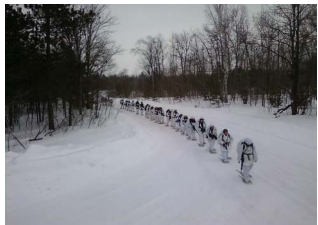
Platoon on the march