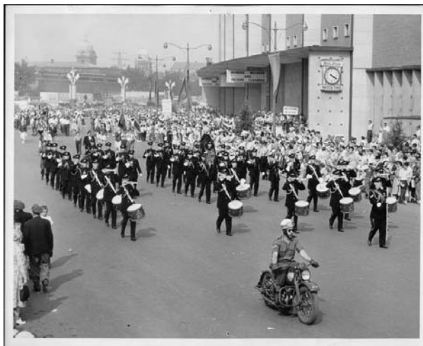
8th Signals Band circa 1955

"Committee chairs updating your list of volunteers. The information should include full name, address, contact phone number and email address if available. Please include former members of your team who may have spent some