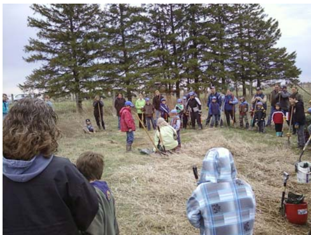
An introduction by Liaison Staff of South Simcoe Streams Network showing over 50 participants how to plant tree shrubs, explain their purpose and provide some general safety tips. Volunteers planting from 09:00 to 14:30 hrs.