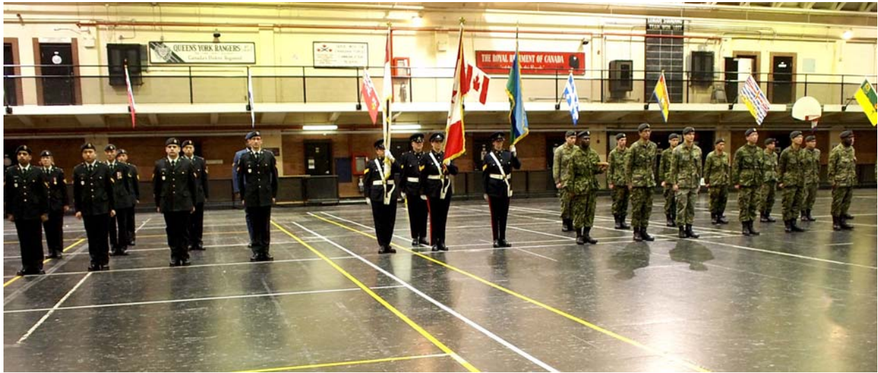
CO's Parade 07 March 2011