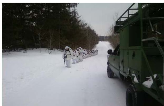
Alpha Platoon during Winter Warfare training exercise at CFB Borden.