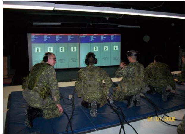
Bravo troop taking aim, also training on the FAT Fire Arms Training Simulator (above)